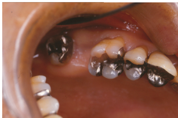
Fig. 1. Maxillary second molar is missing.

used for about one year during the periodontal therapy.