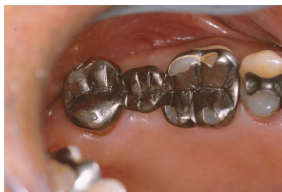
Fig. 6. Six years and six months after bonding.

For the second step, fabrication of a fixed partial denture was planned. This was due to improvement in the condition of the periodontal tissues of abutments, as well as a request for a fixed prosthesis by the patient. Intercuspal position and lateral mandibular movement were examined intraorally with articulating paper and extraorally using a stone cast. After examination of the maxillo-mandibular relation, the areas to be reduced were determined. Reduction of cusps was judged as unnecessary. However, inlay restorations of both first and third molars were removed and a base material was placed. An FPD consisting of two retainers and a flat back pontic was cast from a silver-palladium-copper-gold alloy (Castwell M.C. 12, GC Corp., Tokyo, Japan).