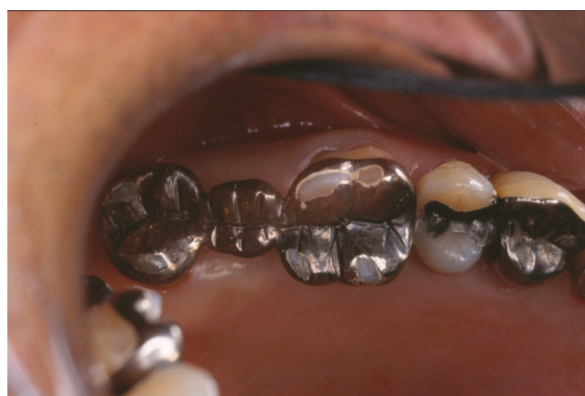
Fig. 5. Resin-bonded fixed partial denture.