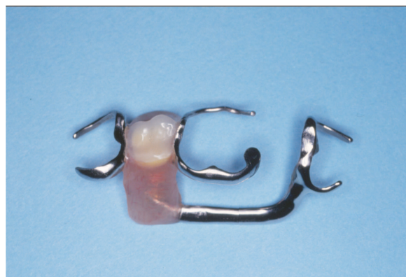
Fig. 2. A removable denture with three clasps.