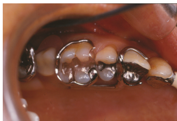
Fig. 4. Seated removable partial denture.