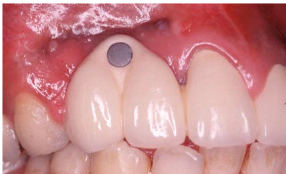
Fig. 4. Fixed partial denture and removable gingival extension set in place.